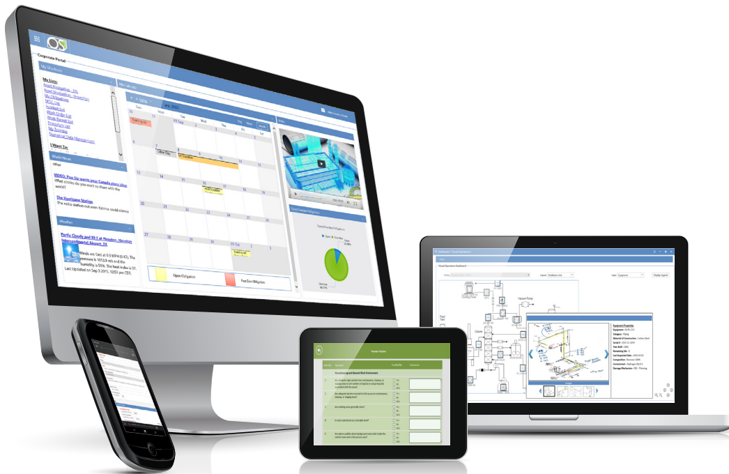
OESuite™ digital forms work across various devices

For more information email us at info@DrivingOE.com or call (713) 355-2900.